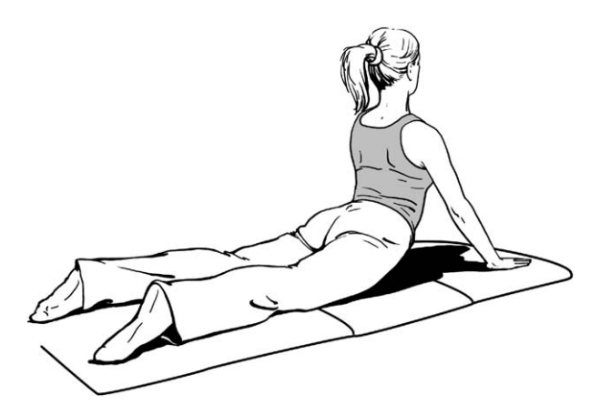
Figure 3 Cobra.