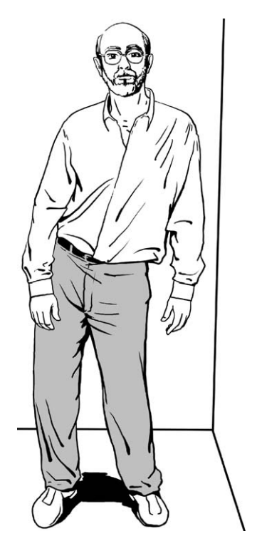
Figure 5 "Locked" back.

Since your nerves are behind your disc bending forward usually squeezes the bulging disc into the spinal nerve roots. Therefore, it is important to avoid slouching or slumping forward when sitting, standing or bending for things. McKenzie realized that it is also helpful to "milk" the disc forward of the nerve roots by performing a variety of back bending or extension exercises. These may be uncomfortable in your back, BUT after a few repetitions you should feel that your leg symptoms are lessening. Scientific studies have proven that