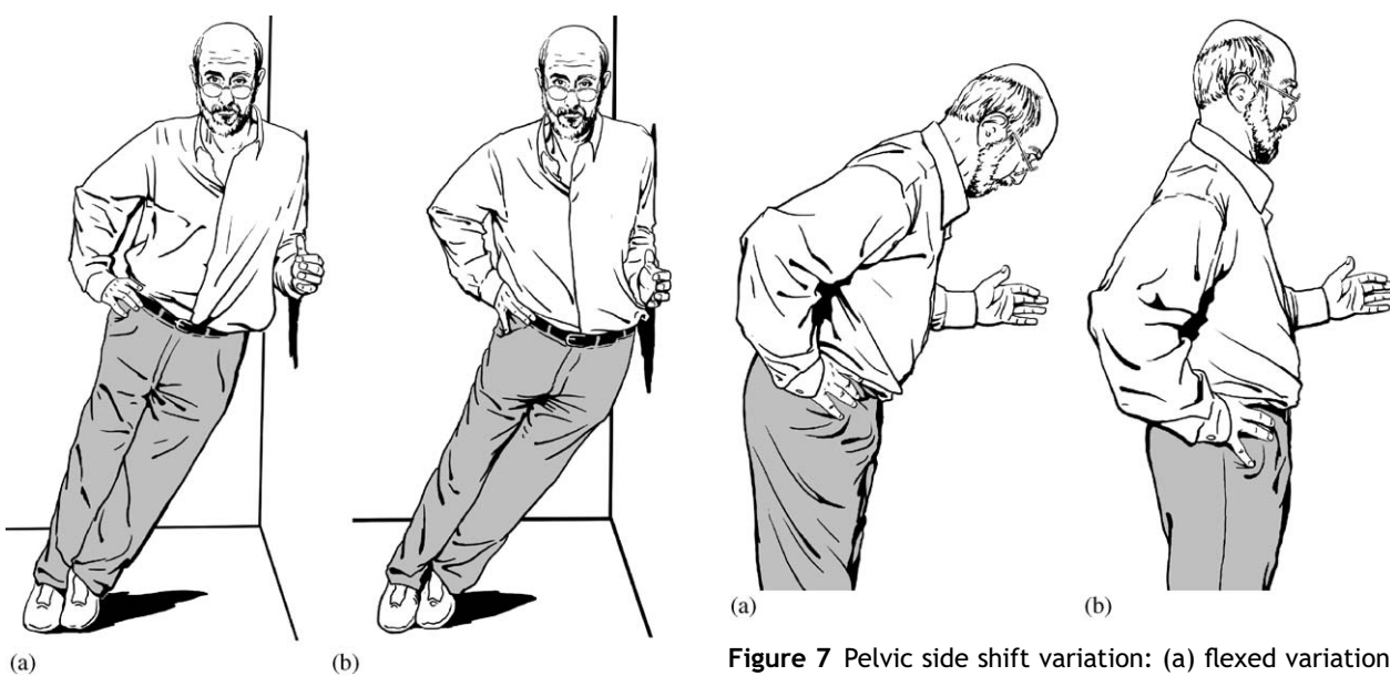
Figure 6 Pelvic side shift: (a) start position (b) end position.